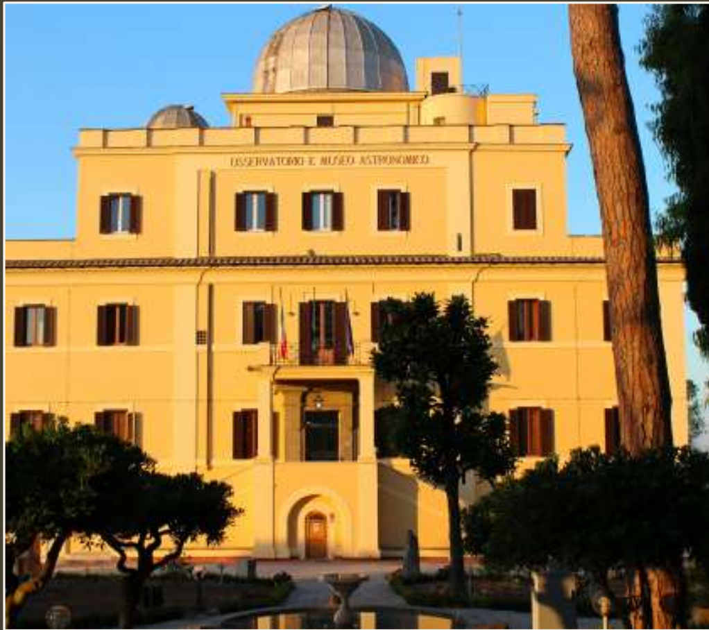
Villa Mellini- Headquarters of National Institute for Astrophysics (INAF)