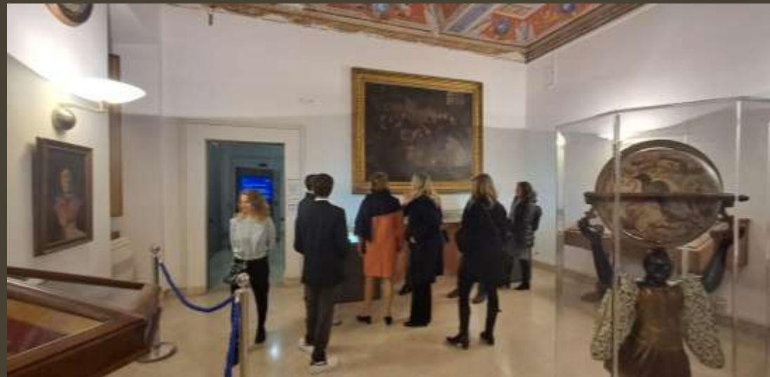
Villa Mellini- The Copernican Hall during the inauguration

The Museum was opened with a public ceremony on March 22 in the presence of the Polish Ambassador in Italy.