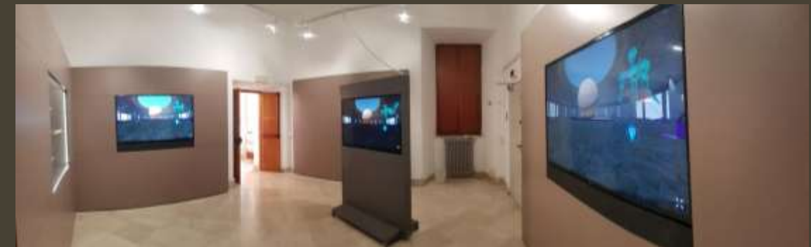
2016: THE MODERN EXHIBITION SET-UP IN VILLA MELLINI