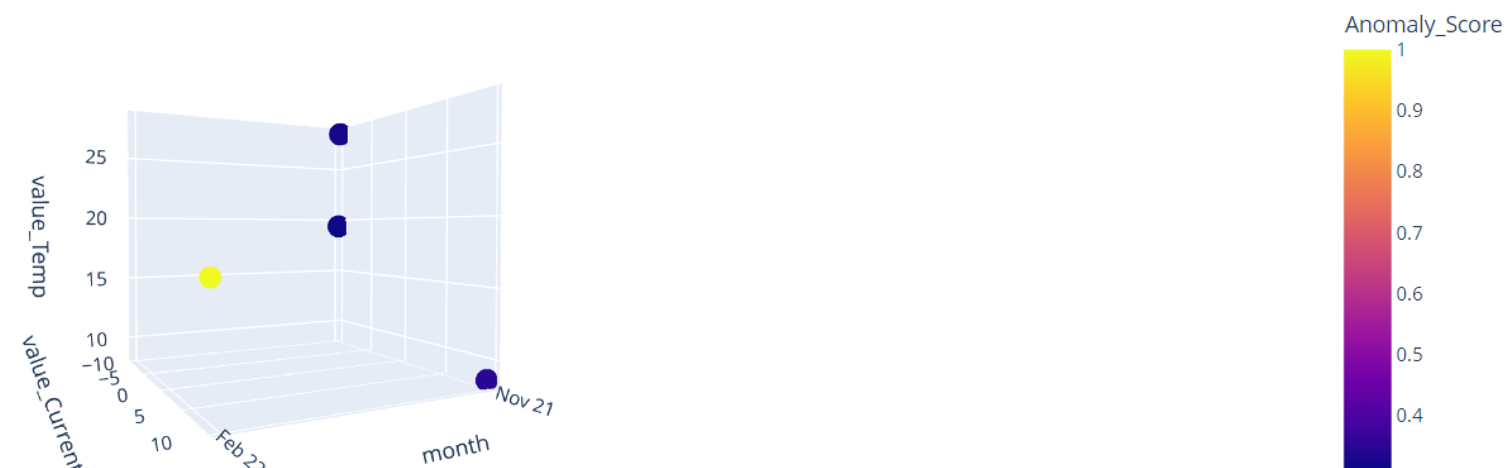
Fig. 2: As an example of the failure event that occurred on February 2022. The telescope brake failed and the telescope remained unusable for a long time. But our model would have signaled this at November 2021, based on the engine temperature, torque, current and status information. This would have prevented the telescope engine from breaking and would have reduced the telescope's down time.

The telescope sends a time series of data from a number of different sensors designed to monitor several mechanical and electrical components. Once the large amount of Array of Cherenkov Telescopes data is obtained, various techniques for extracting data are applied as the data are presented in raw form. The approach used for data storage is based on the cross-industry standard process for data mining (CRISP-DM) model. This model offers a standard process for implementing a data mining project. It consists of 6 phases: business understanding, data understanding, data preparation, modeling, evaluation and deployment. For Step 5, modeling, of the CRISP-DM, unsupervised models are chosen because the data in our possession do not present information related to the failures of our telescope. The unsupervised model that gives the best result is the clustering model. In fact, it, can find the fault of the telescope well ahead of time. This work enhances the analysis of the maintenance of telescopes little present in the literature, focusing on critical components, that is to say components with a greater probability of failure.